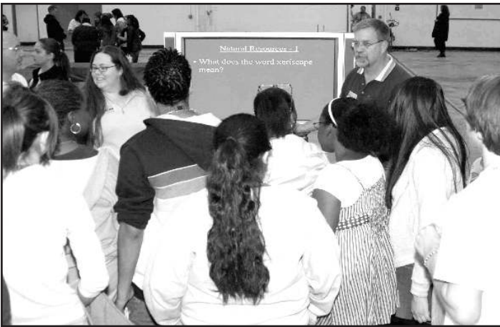
Environmental staff from Lockheed Martin Aeronautics / Palmdale play an environmental career game with students during the Annual Salute to Youth Conference.

More than 100 hundred representatives from a variety of businesses and organizations were on hand to share career tips, education, information and guidance with the upcoming seniors as they begin to make important college and career choices.